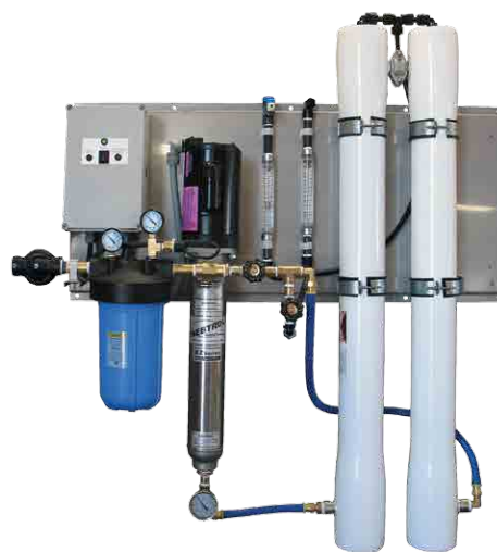
Series R14 Wall Mount

Do not use with water that is microbiologically unsafe or of unknown quality without adequate disinfection before or after the system.