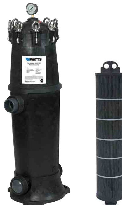
Series Big Bubba

Do not use with water that is microbiologically unsafe or of unknown quality without adequate disinfection before or after the system.