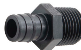
Male NPT Adapter

⚠ CAUTION This Engineering Sheet is not intended to provide full installation instructions and safety information. In order to avoid property damage or injury, please refer to the complete installation manual and product safety information provided with the product.