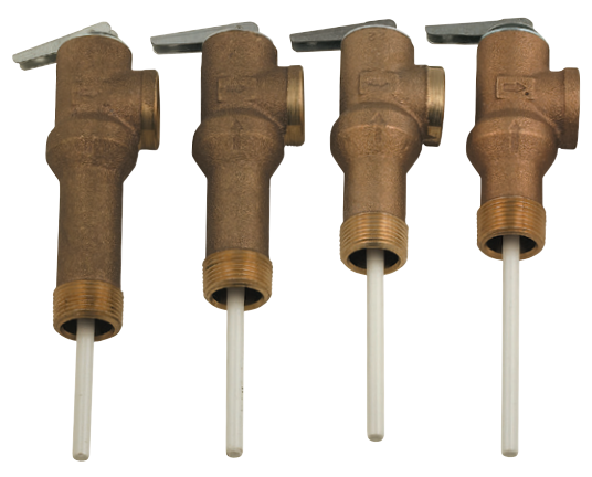
LFLLL100XL LFLL100XL LFL100XL LFSL100XL