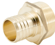
LFWP12 Crimp x MPT Threaded Adapter