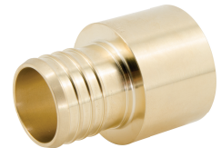
LFWP11 Female Sweat x Crimp Adapter