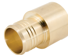
LFWP10 Male Sweat x Crimp Adapter