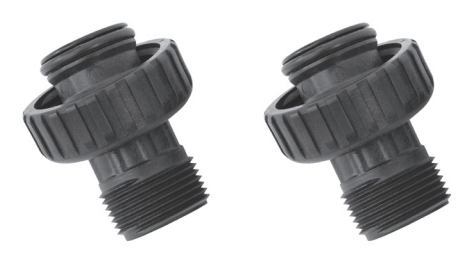
2 NPT Threaded Inlet/Outlet Adapters (x2)