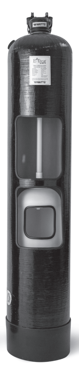
E-Treat PN # 68101336