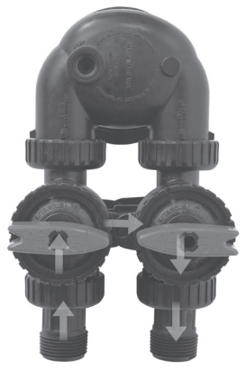
Supply Water Water Supply Enters Exits