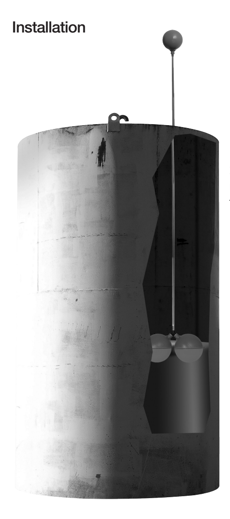
2 x 6" (150mm) floats required when extension tube is used

Body: Acetyl Arm: 316 S/S Floats: Polyethylene