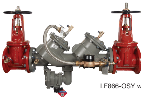
LF866-OSY with flood sensor