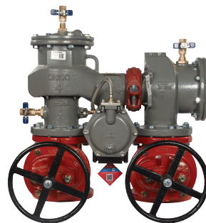
LF880V-NRS with flood sensor