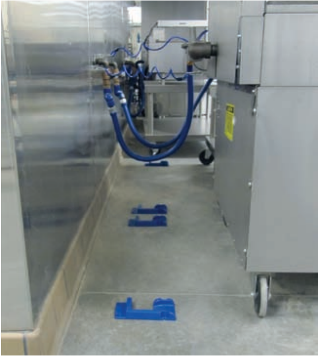
Figure 1 Gas ranges with flexible connectors.

Connectors must be selected to provide the gas demand at the minimum pressure of the appliance. Figure 2 provides a detail of commercial kitchen gas piping requirements. PSD