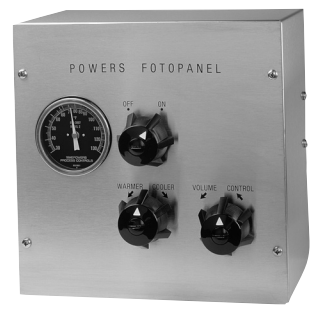
FotoPanel Model 440-1000

*Select model number based upon capacity requirements.