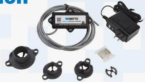
BMS Sensor Connection Kit (Small Diameter) Shown

Series LF909-FS/909RPDA-FS now come standard with an integrated flood sensor. Activate flood detection technology through an add-on connection kit and enjoy peace of mind with real-time alerts when potential flood conditions are detected in your facility.