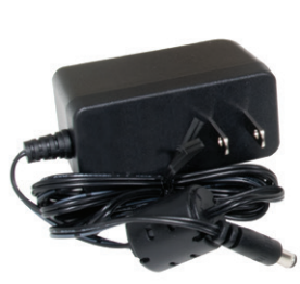
The AC-DC power supply can be used if a 120VAC outlet is nearby or if the device is going to be installed for an extended period of time.