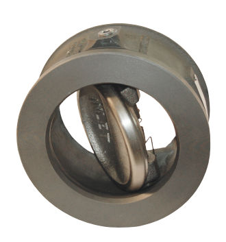
Model 1600 Front