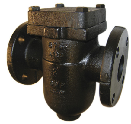
Models 165, 166-DI *165-DI available upon request. Consult Factory.