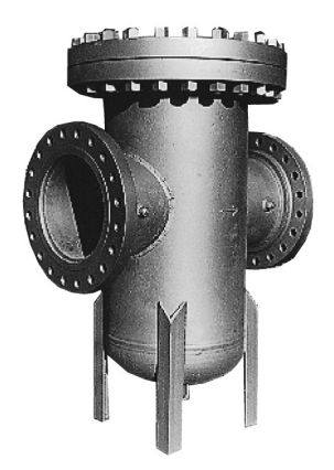
Models 185FAB-B, 186FAB-B