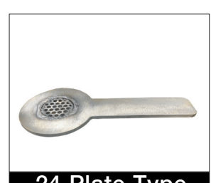
24 Plate Type

Outside In: Flow enters through the perforated portion and exits at the flange.