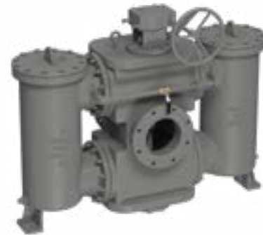
Model 691MF SM

Mueller Steam Specialty product specifications in U.S. customary units and metric are approximate and are provided for reference only. For precise measurements, please contact Mueller Steam Specialty Technical Service. Mueller Steam Specialty reserves the right to change or modify product design, construction, specifications, or materials without prior notice and without incurring any obligation to make such changes and modifications on Mueller Steam Specialty products previously or subsequently sold.