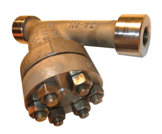
Model 863M-SS, 864M-SS