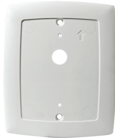
Adaptor Plate 012

The Adaptor Plate 012 covers the paint ring left behind when replacing other thermostats, so that no patching or painting the wall is required. The adaptor plate also allows a thermostat to be installed onto a single gang electrical box. The adaptor plate package includes screws for mounting the adaptor plate and the device that attaches to it.