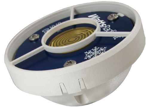
Snow Sensor 095

The Snow Sensor 095 is an aerial mounted sensor that detects falling snow and allows a Watts Radiant Snow Melting Control 653 or 654 to automatically start the snow melting equipment. System stop is provided by the control's timer or by manual disable. The Snow Sensor mounts to a nominal 1/2" (16 mm) metal or PVC conduit or pole. The sensor is well suited to adding automatic start to an existing snow melt system.