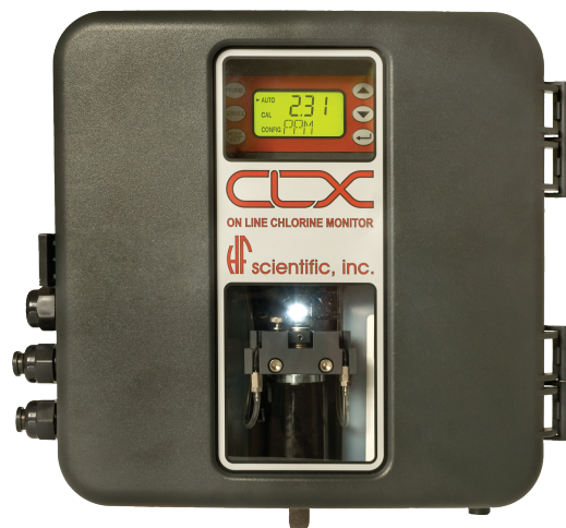
Changing the Sample Cuvette

Listed or Certified to CE, UL, CSA (ETL,ETLc)