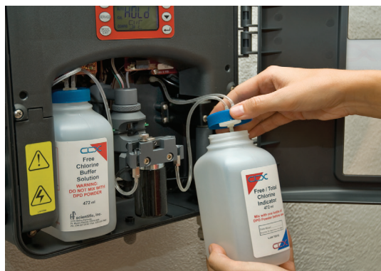
Changing the Reagents

The Residual Chlorine Monitor shall be able to measure free or total chlorine using the DPD colorimetric method. The Chlorine Monitor shall have a measurement range of 0-10 mg/l. The Chlorine Monitor shall include the power supply, sensor and display in one corrosion resistant enclosure. The Chlorine Monitor shall have readings consistent with laboratory and portable Chlorine Photometers. The Chlorine Monitor shall have standard 4-20 mA outputs and RS-485 with Modbus Protocol. The 4-20 mA output shall be standard or reversible. The Chlorine Analyzer shall have a removable sample cuvette. The sensor shall have a clear view to the optical chamber allowing viewing of the sample and reaction of the reagents, before, during and after a reading. Accuracy shall be \pm 5\% with a resolution of 0.01 mg/l for the range of 0-6 mg/l and \pm 10\% with a resolution of 0.01 mg/l for the range of 6-10 mg/l. The Chlorine Monitor shall have a user selectable cycle time between 110 seconds and 10 minutes (optional 60 seconds to 10 minutes). The Chlorine Monitor shall be capable of 30 days of unattended operation. The Chlorine Monitor shall take a zero reading before each reading to compensate for color in the sample. The Chlorine Monitor shall have microprocessor based technology. The Monitor shall have two user selectable alarm relays.