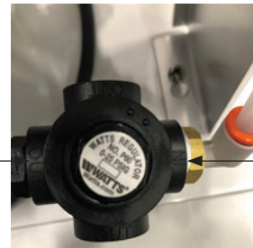
9 Inlet Label (White Fitting, Orange Connector, Clear Tubing)