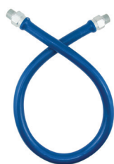
Blue Hose® Gas Connector