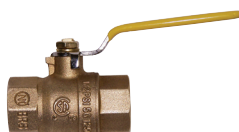
Full Port Shutoff Valve