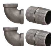
F x F Elbows + Pipe Nipples*