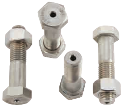
Pre-drilled Bolts Patent Pending

In order to avoid time consuming and costly drilling of flanges to properly tag backflow preventers, Watts NYC backflow preventers are supplied with four sets of 304 stainless steel bolts/nuts, with a 1/4" hole drilled axially through the bolt. These bolts/nuts are also available for flanges sizes 2 1/2"-10" in separate kits of 4.