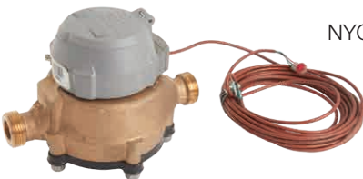
NYC Compliant Meter

Watts NYC models of the 709DCDA double check detector assembly utilize a Badger M35 meter. Consult Badger Meter for additional details or technical information.