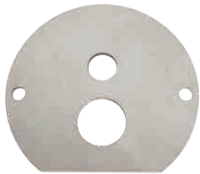
Discharge Control Plate

In order to more easily meet NYC rules on protecting against 8-hours of maximum RPZ discharge, an optional discharge control plate for the LF909 is available for valves sizes 4"-10". The discharge control plate comes with the hardware necessary to install it. The new discharge profile is available to the right.